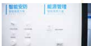
Smart security systems