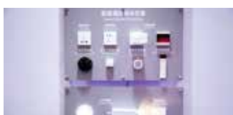
Smart home solutions