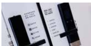
Smart door locks