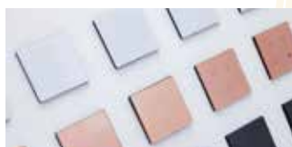
Smart control panels