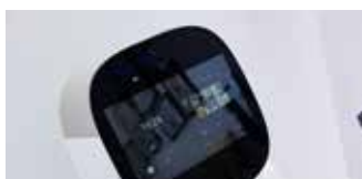
AI voice control systems