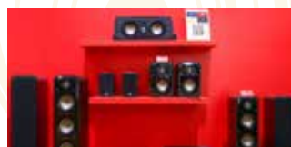
Audio-visual and home entertainment systems